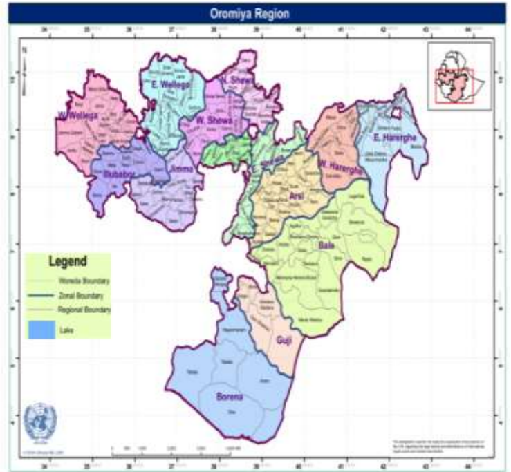
Map 1. The location of Abbay Choman district in the map of Horro Guduru Zone and Oromiya region.